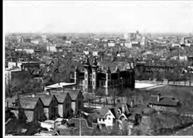
St. Paul's College, looking northwest from Portage and Edmonton. 1927