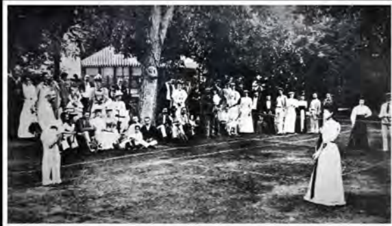
A mixed pairs match at the WLTC c. 1900s